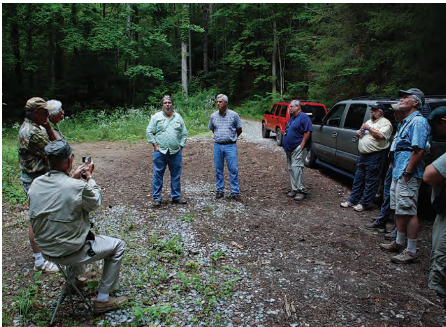
TU volunteers gather at Rocky Fork, Tennessee to discuss fundraising options with land trust partners to permanently protect 16 miles of coldwater streams.