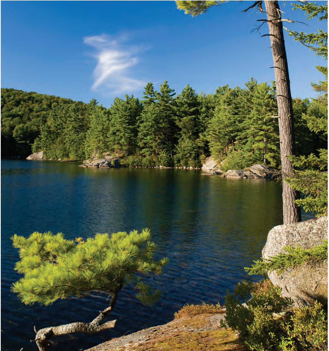
Ashuelot River Headwaters, New Hampshire.