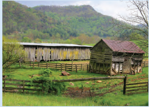
Working landscape in the mountains of North Carolina.

Farming, ranching and forestry can be highly compatible with watershed and riparian protection. Working lands can buffer streams, lakes and rivers from residential neighbors, commercial land uses, roads and other uses that might directly impact water quality and habitat integrity.