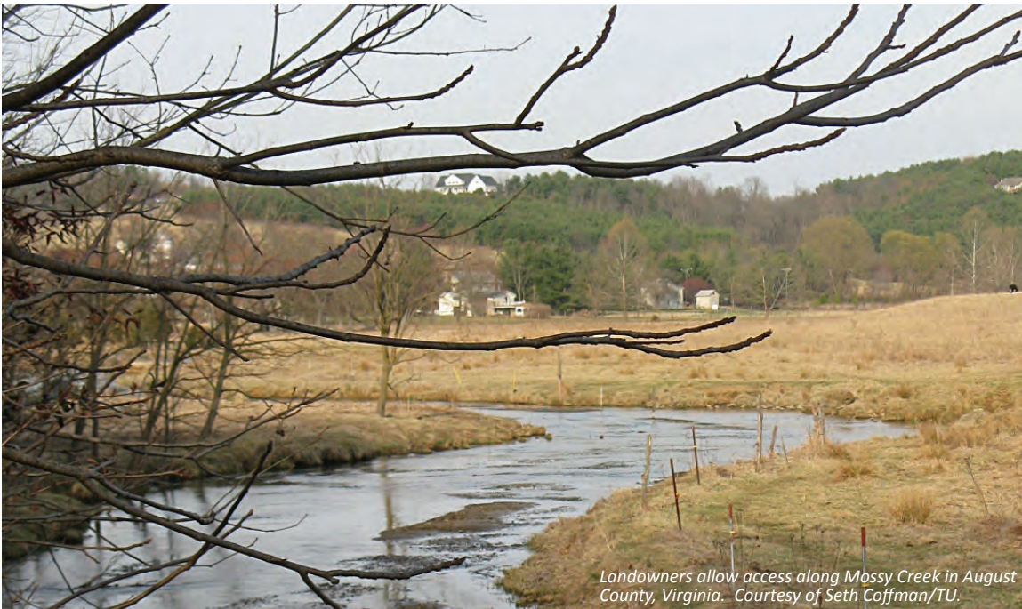
Landowners allow access along Mossy Creek in Augusta County, Virginia.