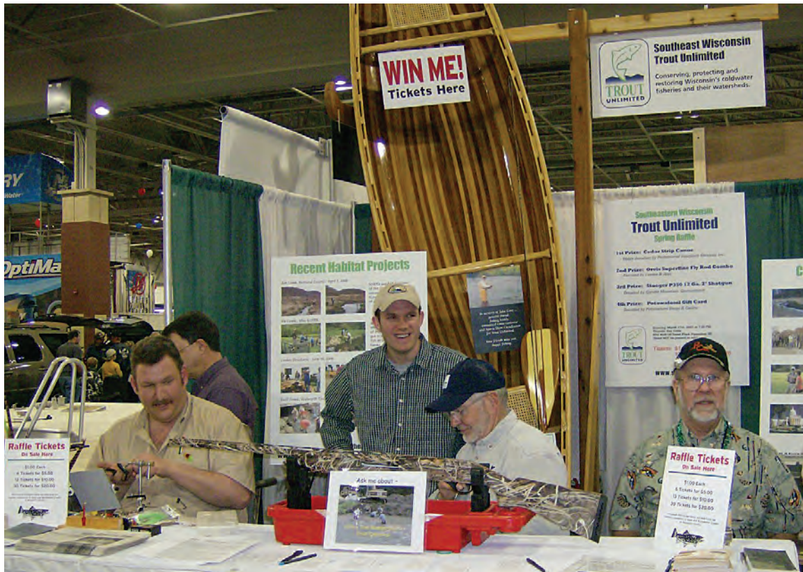
Southeastern Wisconsin TU chapter members raising funds for stream restoration projects.

In recent years, some chapters and councils have dedicated a percentage of their income to land protection projects. For example, one chapter in New Hampshire has made regular donations of a few thousand dollars to land protection projects in the watersheds of the Chapter's membership. Some land trusts have found that a thoughtful solicitation to the local TU chapter for projects on coldwater streams is almost always met with at least a modest contribution.