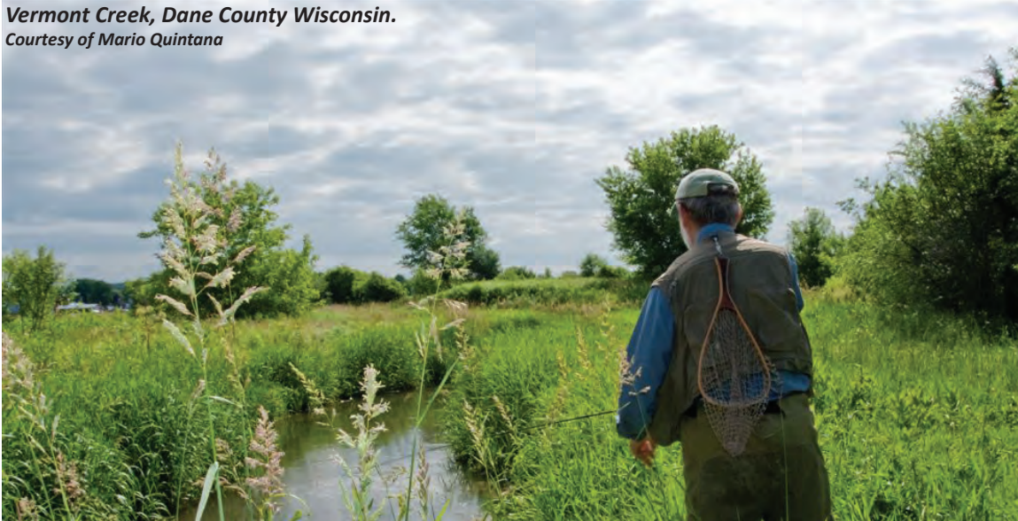
Vermont Creek, Dane County Wisconsin.

Although every project is unique, the following examples are provided to demonstrate scenarios that could be used as templates in future projects: