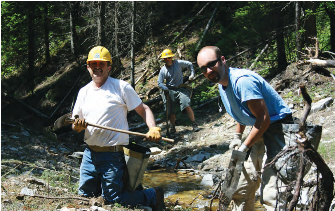
TU volunteers from the Westslope Chapter TU plant trees for an Embrace-A-Stream funded project along Eustache Creek near Missoula, Montana .

This TU grant program provides matching grants of up to $10,000 for on-the-ground projects to chapters and partners. These matching funds are used for stream restoration, barrier removal and other riparian project work. Since 1976, Trout Unlimited has provided grants to TU chapters engaged in a variety of projects that conserve coldwater fisheries through innovative grassroots action. Overseen by a committee of TU volunteers and administered by the national office, TU annually raises money from TU members, corporate and agency partners and foundations to distribute as grants up to $10,000. A hallmark of EAS projects is successfully leveraging cash and other in-kind services. EAS has funded 959 individual projects for a total of more than $3.9 million in direct cash grants, that TU chapters and councils have contributed an additional $12.7 million in cash and in-kind services. Please go to www.tu.org/eas for more information.